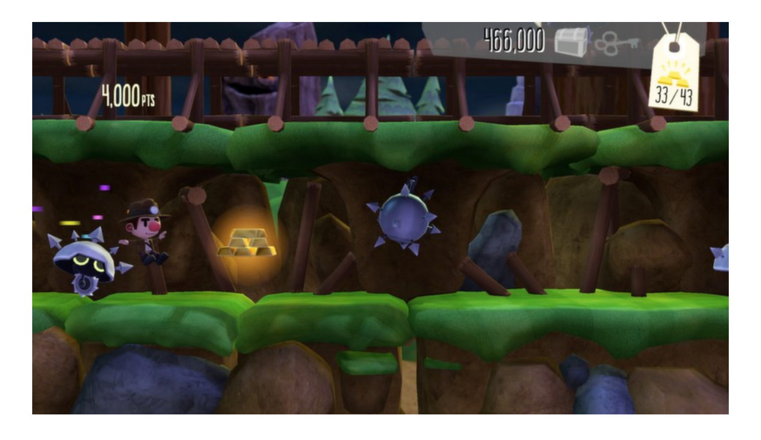
Runner2 - Good Friends Character Pack Full Crack [Xforce]

Download ->->-> <a href="http://bit.ly/2JnDpeE">http://bit.ly/2JnDpeE</a>